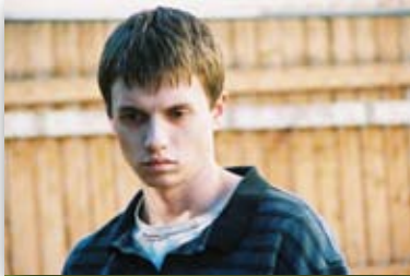
Still from the Kodak 35mm project "April's Last"

Over a dozen of the selections for the 2007 Arizona International Film Festival were films from University of Arizona School of Media Arts alumni, students, and faculty. One of the School of Media Arts most noteworthy projects, "April's Last," was selected to screen at the 2007 Arizona International Film Festival.