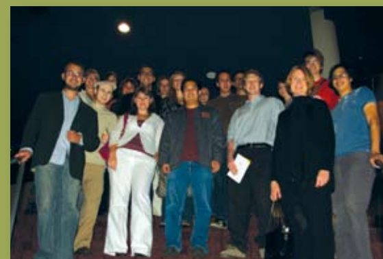
UA Media Arts Kodak 35mm project screening team at the Los Angeles premiere of "April's Last."

The screening took place at ArcLight Cinemas and was followed by a reception. The student crew and faculty involved in the project traveled to Los Angeles for the screening to represent the UA School of Media Arts.